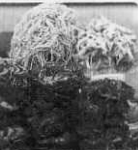
STREET FOOD AT BOGYOKE AUNG SAN MARKET P54, YANGON